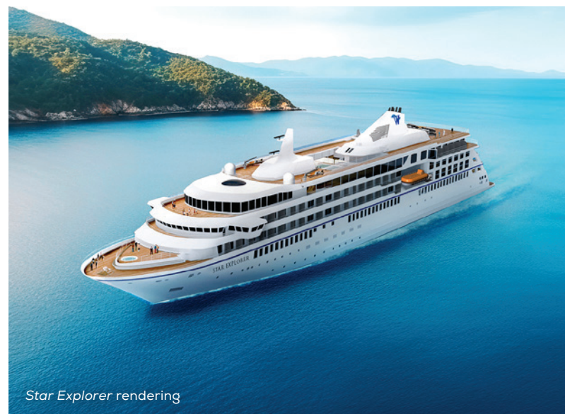
Star Explorer rendering

Access to board ship is via stairs only. Access to/from outside deck may require assistance with doors and thresholds.